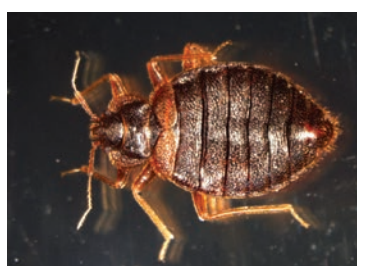
Figure 1. Bed bug

In recent years, reports of infestations are becoming more frequent in homes, hotels, dormitories, and other locations. Bed bugs are most often associated with clutter and filth, but infestations have also been reported in the finest hotels and living accommodations. Although there is no specific explanation for the resurgence of this pest, increased international travel and pesticides with reduced residual activity have probably contributed.