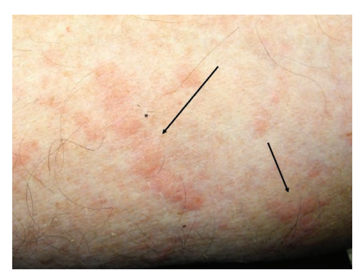
Figure 6. Bed bug bites

Both nymphs and adults typically feed at night but hide in nearby crevices and cracks during the day. Their small size and flattened bodies make it easy for them to hide in the seams of mattresses and box springs, cracks in bed frames and bedside tables, under loose wallpaper, behind wall hangings, and in other furniture. Although bed bugs do not live in nests or colonies, they do tend to congregate around good hiding places. These areas are usually evident because they are stained with dark red to blackish spots, which is dried bug excrement (Figure 4). There may also be eggs, eggshells, and the brownish molted skins (exuviae) of the maturing bugs (Figure 5).