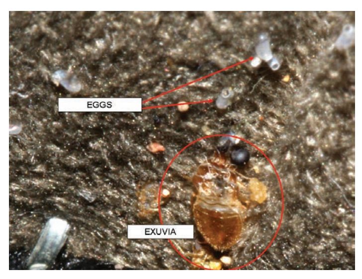
Figure 5. Bed bug indicators

During early stages of infestations, bed bugs are most commonly found in or near the bed, so inspections should begin by examining the mattress, bed frame, and headboard. Because these insects are small and secretive, they