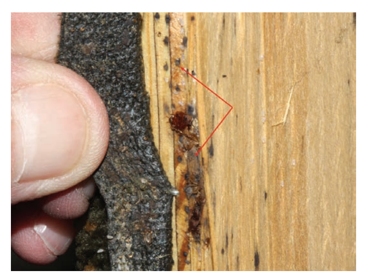
Figure 4. Dried bug excrement

the other carries body fluids from the host into the bug. Saliva may produce swelling and itching, and these areas may become infected when scratched.