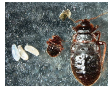
Figure 2. Eggs, nymph, and mature bed bug